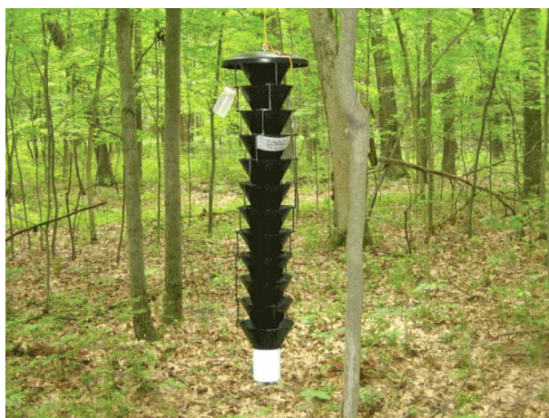
Figure 8 A Lindgren funnel trap used for trapping beetle pests in forest. The trap is baited with semiochemical lures, and the elongated shape mimics a tree trunk. Beetles that impact the trap fall into the funnels and ultimately the collecting jar at the bottom.

the collecting jar transparent. For some cone traps, liquid preservatives, such as ethanol, can be held in the collecting jar or insecticidal kill strips can be used to further retain insects and aid in processing (Hardee et al., 1996). Cone traps can be mounted on crop for flying insects or placed on the ground for crawling pests. Depending on the design, the latter may be referred to as pyramid traps or Leggett traps and are used for trapping pest beetles which may crawl as well