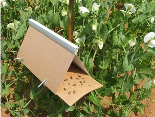
Figure 2 Delta trap with sticky trap insert. The trap is baited with a pheromone analogue to attract male pea moths ( Cydia nigricana ).

threshold is 10 or more moths in either trap during two consecutive occasions, with spray date determined by a computer model of moth egg development. For vining crops, the presence of any male moths suggests that control will be necessary (PGRO, 2022; Ramsden et al., 2017; Wall, 1988).