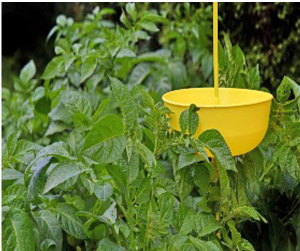
Figure 1 Yellow water trap mounted on a central pole within a potato crop and used to monitor pest aphid species.

Yellow water traps are used to monitor pest aphid species on potato crops in the UK (AHDB, 2021; AHDB Potatoes, 2021) (Fig. 1). Aphids can vector potato viruses, and this monitoring system is concerned with transmission of potato