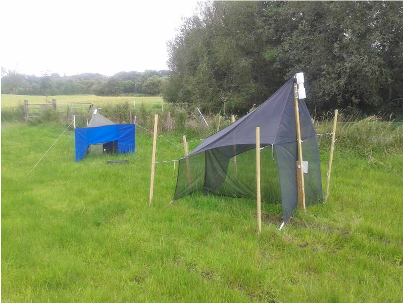
Figure 4 The Malaise flight interception trap is ideal for biodiversity sampling of flying insects, particularly Diptera and Hymenoptera. As a large, delicate and non-selective trap, its use in crop protection has mainly been for experimental studies.

insect biodiversity (Skvarla et al., 2021), and as the catches are retained directly in preservative, the quality of specimens is good. This makes the Malaise trap an ideal technique for collecting Diptera and Hymenoptera (Skvarla et al., 2021), including parasitoids (Darling and Packer, 1988; Fraser et al., 2008), which can have relevance to crop protection. Malaise traps have been often used for experimental purposes and to assess biodiversity in agro-ecosystems (Burgio and Sommaggio, 2007; Chay-Hernández et al., 2006; Letourneau et al., 2012; Macfadyen and Muller, 2013; Volpato et al., 2020). One particular study attracted much attention, with an apparently drastic decline in flying insect biomass over 27 years as derived from Malaise trap samples taken in mixed landscapes in Germany (Hallmann et al., 2017). However, Malaise traps are not generally used for routine pest monitoring as they are large and delicate and produce an extensive and mostly indiscriminate catch.