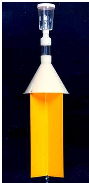
Figure 6 A cross-vane trap for monitoring brassica pod midge and its parasitoids in oilseed rape. The trap is baited with brassica-derived kairomone lures, with different compounds attracting either pests or their parasitoids.

baited with allyl isothiocyanate than the control; whereas D. brassicae 's main parasitoid, Platygaster subuliformis (Kieffer), was caught predominantly in traps baited with 2-phenylethyl isothiocyanate. The advantage of this system is that it can trap both the pest and natural enemy selectively dependent on the plant kairomone lure. Most pest monitoring systems are targeted towards the pest but do not necessarily monitor the presence of natural enemies. Knowledge of the occurrence and prevalence of both would lead to more refined economic threshold parameters and targeted integrated pest management approaches (Zhang and Swinton, 2009).