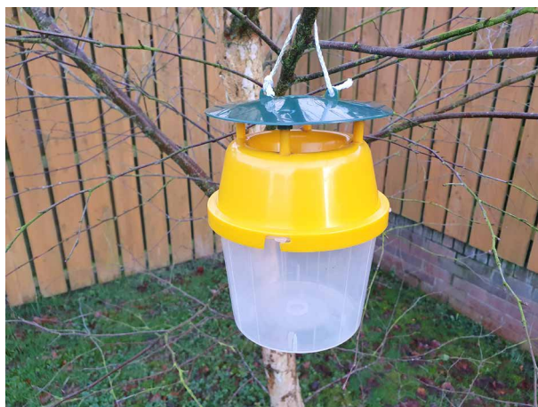
Figure 7 A moulded plastic funnel trap for trapping moths.