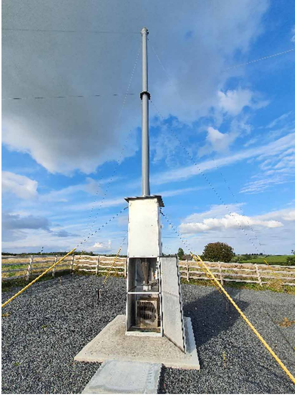
Figure 3 Rothamsted 12.2 m suction trap used to sample aphids. The trap is permanently sited and mains powered with an impeller fan housed in the stainless steel body and a long, vertical sample pipe to collect aphids migrating to and from crops. The door of the trap is open showing the collecting mesh and four sample containers, which rotate every 24 h.

Aphis glycines Matsumura, an invasive pest first found in North America in 2000 (Rhainds et al., 2010; Schmidt et al., 2012). There are also suction trap networks in New Zealand (Teulon et al., 2004), South Africa (Krüger and Laubscher, 2013) and China (Qin et al., 2013). Individual traps are operated in Northern Ireland by the Agri-Food and Biosciences Institute and in the Republic of Ireland by Teagasc.