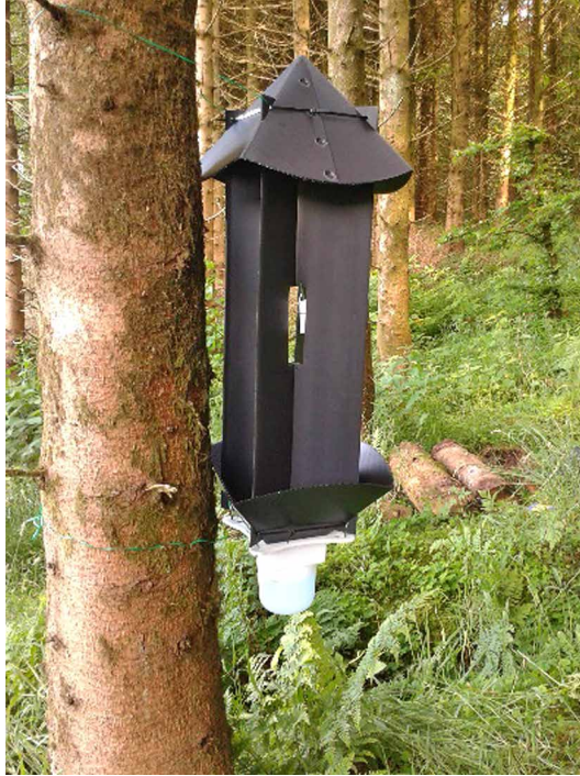
Figure 5 A cross-vane trap used for trapping bark beetles in forestry. The trap is baited with a lure, and beetles impact the vanes and fall into the collecting funnel and jar at the bottom.

bottom funnel leads to a collecting jar containing a preservative. Flying insects are intercepted by a clear trap or attracted to the colour, lure or light source whereupon they impact the trap and fall, or crawl, into the collecting funnel. The trap may be suspended from a branch or frame (Hines and Heikkinen, 1977; Wilkening et al., 1981) or mounted on a pole (Murchie et al., 1997).