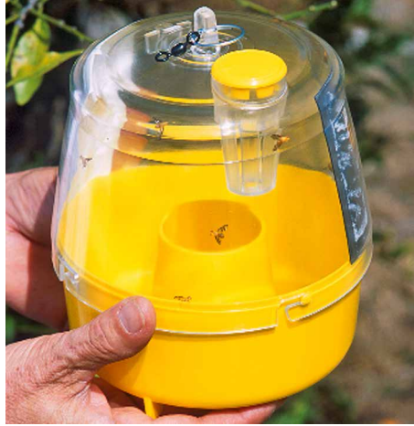
Figure 9 A McPhail trap for monitoring fruit flies (Tephritidae). Flies enter the trap through an inverted funnel entrance in the bowl base attracted by pheromone lures or liquid food baits.