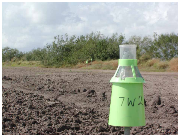
Figure 10 A boll weevil cone trap. Weevils are attracted to the colour and pheromone plume from the baited traps. Upon landing, they move upwards into the cone and are retained within the collecting jar at the top.

synthetic pheromone (Hardee et al., 1972; Tumlinson et al., 1969). The basic boll weevil trap consists of three parts: a light green or yellow upwardly tapered plastic cylinder, with a mesh funnel above leading to a transparent collecting jar (Fig. 10). Boll weevils are attracted to the colour of the trap and the pheromone plume. On landing on the tapered cylinder, they move upwards to the pheromone, through the overlapping funnel into the collecting jar. The specifics of the trap have been under constant refinement since the early 1970s, but most current traps follow the basic design of Mitchell and Hardee (1974) (Dickerson, 1986; Hardee et al., 1996). Boll weevil cone traps are used extensively in the Cotton Boll Weevil Eradication Program in the USA, a collaborative venture involving the USDA, state governments, researchers and cotton producers, which has seen boll weevil eradicated from most of the USA (Raszick and Bernaola, 2021).